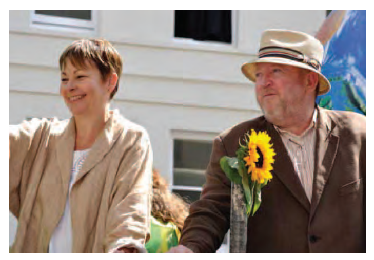
Keith with Caroline Lucas MP on a Gay Pride float in Brighton.

Intergroup on Gay and Lesbian rights and have fought for equality across Europe. They have been powerful advocates for the European Court enshrining the legality of LGBTIQ anti-discrimination laws and tackling homophobia around the world.