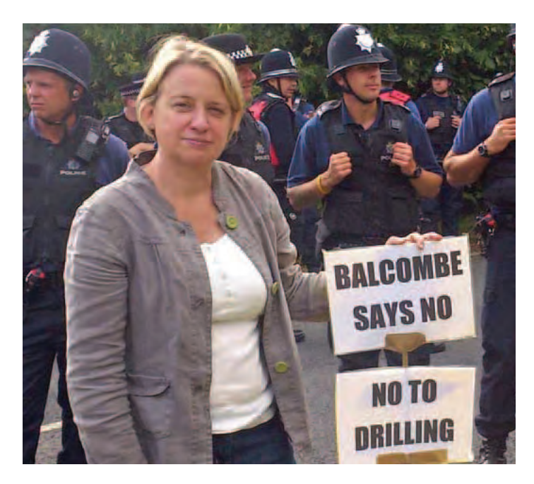
Natalie Bennett, Leader of the Green Party, demonstrates against fracking at Balcombe.

The Green Party has long led the way in protecting the climate. We have long argued that we need to build a low carbon, renewably powered society. We have always understood that solving the climate crisis is a question of economic policy, housing policy, energy policy, transport policy: it is about changing the system that puts profit before the planet. As long as a wealthy few can gain by plundering the earth's resources, they will continue to do so. Our world is interconnected, and so you will find our solutions to the climate crisis in every section of this manifesto. But the challenge also demands specific policies and frameworks. Across Europe and in the EU, Green Parties have had remarkable success in securing these.