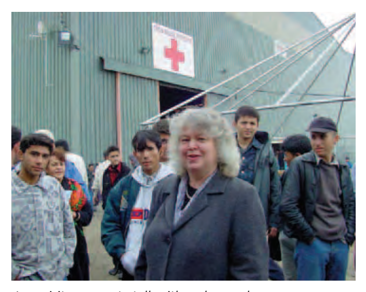
Jean visits a camp to talk with asylum seekers.

Implement measures to ensure that Edward Snowden and future whistleblowers like him are able to apply for protection in EU member states for revealing abuse of the human rights of EU citizens.