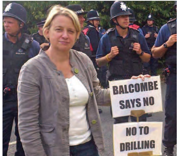
Natalie Bennett, Leader of the Green Party, demonstrates against fracking at Balcombe.

The Green Party has long led the way in protecting the climate. We have long argued that we need to build a low carbon, renewably powered society. We have always understood that solving the climate crisis is a question of economic policy, housing policy, energy policy, transport policy: it is about changing the system that puts profit before the planet. As long as a wealthy few can gain by plundering the earth's resources, they will continue to do so. Our world is interconnected, and so you will find our solutions to the climate crisis in every section of this manifesto. But the challenge also demands specific policies and frameworks. Across Europe and in the EU, Green Parties have had remarkable success in securing these.