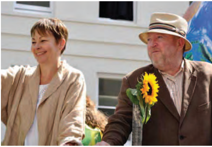
Keith with Caroline Lucas MP on a Gay Pride float in Brighton.

Intergroup on Gay and Lesbian rights and have fought for equality across Europe. They have been powerful advocates for the European Court enshrining the legality of LGBTIQ anti-discrimination laws and tackling homophobia around the world.