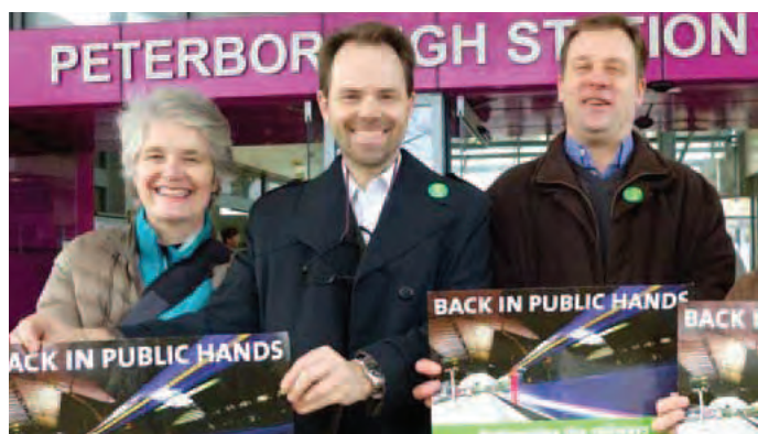
Greens protesting against rail fare hikes